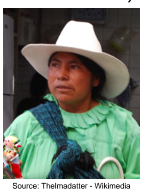
Population: 15,000 World Popl: 15,000 Total Countries: 1 People Cluster: Otomi

Main Language: Otomi, Tenango Main Religion: Christianity