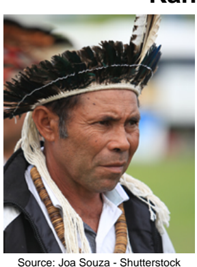
Population: 300 World Popl: 300 Total Countries: 1

People Cluster: South American Indigenous