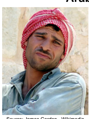
Population: 24,000 World Popl: 19,464,500 Total Countries: 38

People Cluster: Arab, Levant Main Language: Arabic, Levantine