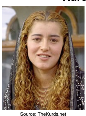
Population: 3,323,000 World Popl: 3,949,700 Total Countries: 5