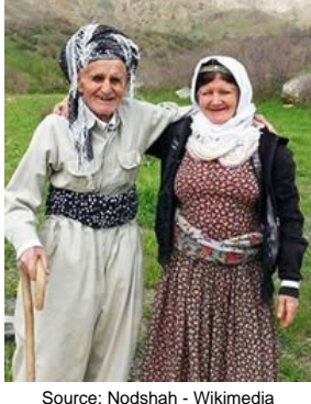
Population: 196,000 World Popl: 421,000 Total Countries: 2 People Cluster: Kurd Main Language: Gurani Main Religion: Islam