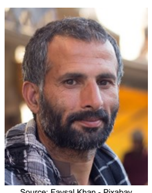
Population: 341,000 World Popl: 49,660,750 Total Countries: 216 People Cluster: Deaf