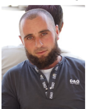
Population: 13,000 World Popl: 1,952,400 Total Countries: 16 People Cluster: Caucasus Main Language: Chechen Main Religion: Islam