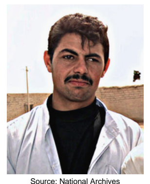
Population: 24,000 World Popl: 24,000 Total Countries: 1 People Cluster: Kurd Main Language: Sarli Main Religion: Islam

Status: Unreached Evangelicals: 0.05% Chr Adherents: 0.30% Scripture: Unspecified