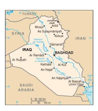
Population: 750,000 World Popl: 750,000 Total Countries: 1 People Cluster: Kurd