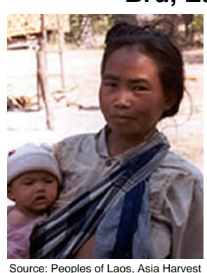
Population: 68,000 World Popl: 118,000 Total Countries: 3

People Cluster: Mon-Khmer Main Language: Bru, Eastern Main Religion: Ethnic Religions Status: Partially reached