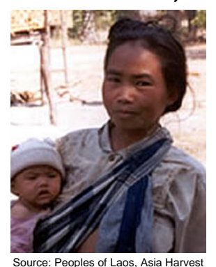
Population: 68,000 World Popl: 118,000 Total Countries: 3

People Cluster: Mon-Khmer Main Language: Bru, Eastern Main Religion: Ethnic Religions Status: Partially reached