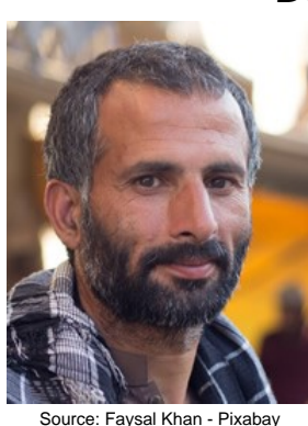
World Popl: 49,660,750 Total Countries: 216 People Cluster: Deaf