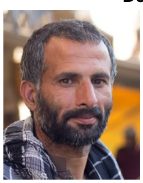
Population: 11,000 World Popl: 49,660,750 Total Countries: 216 People Cluster: Deaf