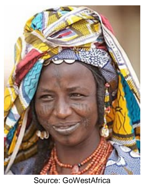
Population: 1,420,000 World Popl: 2,150,500 Total Countries: 4