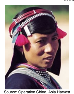
Population: 3,000 World Popl: 3,000 Total Countries: 1 People Cluster: Hani Main Language: Muda

Main Religion: Ethnic Religions Status: * Frontier Unreached