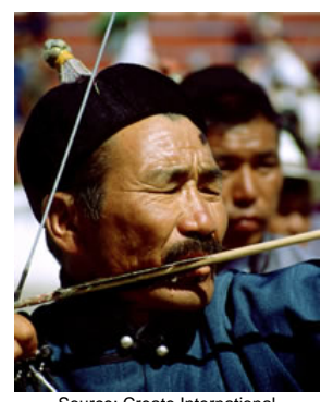
Population: 68,000 World Popl: 68,000 Total Countries: 1

People Cluster: Mongolian Main Language: Mongolian, Halh Main Religion: Buddhism Status: • Unreached