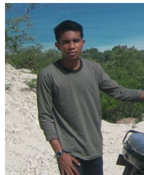
Population: 83,000 World Popl: 83,000 Total Countries: 1 People Cluster: Timor Main Language: Amarasi Main Religion: Christianity