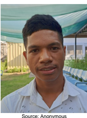
Population: 166,000 World Popl: 166,000 Total Countries: 1 People Cluster: Timor Main Language: Mambae Main Religion: Christianity