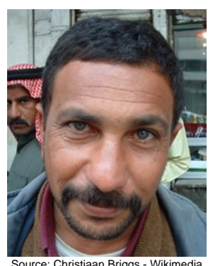
Population: 22,000 World Popl: 22,460,800