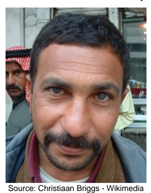
Population: 18,000 World Popl: 22,460,800 Total Countries: 25