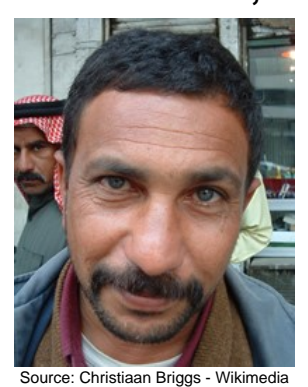
Population: 71,000 World Popl: 22,460,800 Total Countries: 25