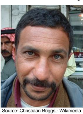
Population: 311,000 World Popl: 22,460,800

Total Countries: 25 People Cluster: Arab, Levant