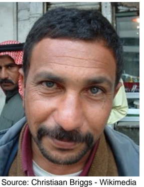
Status: <a> Unreached</a> Evangelicals: 1.50%