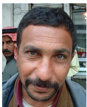
Population: 2,200 World Popl: 22,460,800 Total Countries: 25