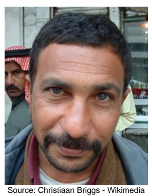
Population: 21,070,000 World Popl: 22,460,800