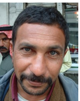
Population: 33,000 World Popl: 22,460,800 Total Countries: 25 People Cluster: Arab, Levant

Main Language: Arabic, Mesopotamian Main Religion: Islam