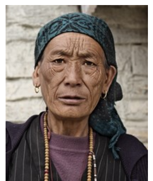
Population: 2,100 World Popl: 1,209,700

Total Countries: 13 People Cluster: South Asia Hindu - other