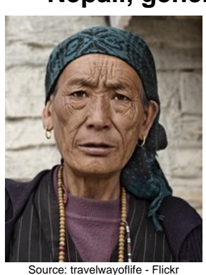
Population: 297,000 World Popl: 1,209,700