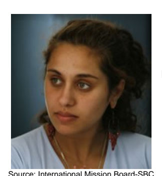
Population: 1,100 World Popl: 222,900 Total Countries: 13 People Cluster: Romani Main Language: Romani, Sinte Main Religion: Christianity