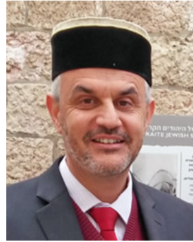
ישראלית ישראלית ישראלית

Population: 200 World Popl: 1,900 Total Countries: 4 People Cluster: Jews Main Language: Polish Main Religion: Ethnic Religions Status: Unreached Evangelicals: 0.00% Chr Adherents: 0.00% Scripture: Complete Bible