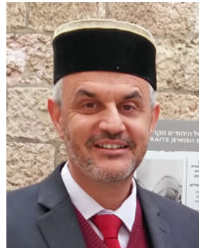
עברית עברית עברית

Population: 200 World Popl: 1,900 Total Countries: 4 People Cluster: Jews Main Language: Polish Main Religion: Ethnic Religions Status: Unreached Evangelicals: 0.00% Chr Adherents: 0.00% Scripture: Complete Bible