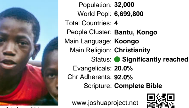
"Declare His glory among the nations." Psalm 96:3