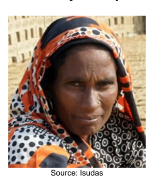
Population: 66,000 World Popl: 1,125,000