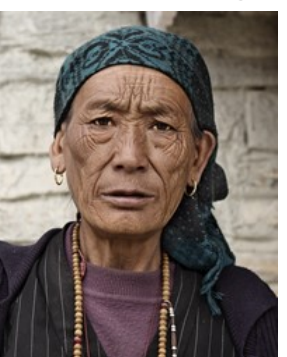
Population: 60,000 World Popl: 1,209,700 Total Countries: 13

People Cluster: South Asia Hindu - other