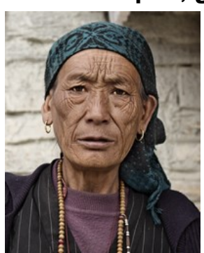
Population: 138,000 World Popl: 1,209,700