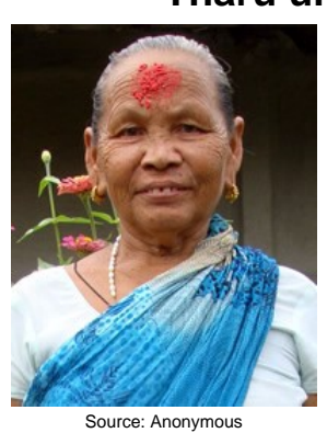
Population: 1,774,000 World Popl: 2,314,000