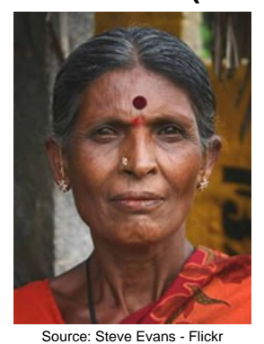
Population: 76,000 World Popl: 8,443,400