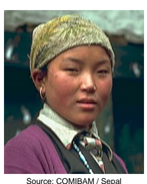
Population: 128,000 World Popl: 190,300 Total Countries: 5