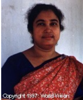
Copyright 1997 - World Vision Source: Bethany World Prayer Center

Population: 161,000 World Popl: 170,300 Total Countries: 2 People Cluster: South Asia Tribal - other Main Language: Hindi Main Religion: Hinduism Status: ● Unreached Evangelicals: Unknown % Chr Adherents: 0.15% Scripture: Complete Bible