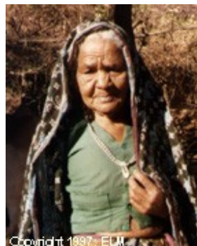
Copyright 1987 - ELM Source: Bethany World Prayer Center

Population: 460,000 World Popl: 467,600 Total Countries: 2 People Cluster: South Asia Tribal - other Main Language: Gamit Main Religion: Hinduism Status: Minimally Reached Evangelicals: Unknown % Chr Adherents: 10.34% Scripture: New Testament