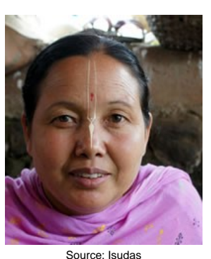
Population: 1,413,000 World Popl: 1,455,000