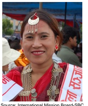
Population: 4,974,000 World Popl: 6,719,900