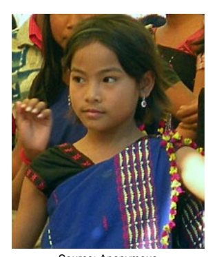
Population: 3,543,000 World Popl: 3,574,000