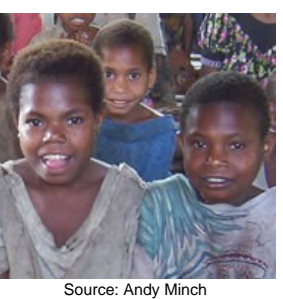
Population: 8,400 World Popl: 8,400 Total Countries: 1

People Cluster: New Guinea Main Language: Amanab Main Religion: Christianity