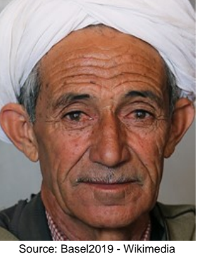
Status: * Frontier Unreached