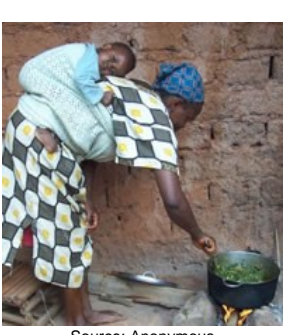
Population: 20,000 World Popl: 20,000 Total Countries: 1 People Cluster: Benue Main Language: Mankong Main Religion: Christianity Status: Partially reached