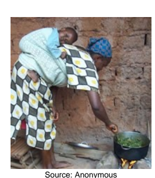
Population: 20,000 World Popl: 20,000 Total Countries: 1 People Cluster: Benue Main Language: Mankong Main Religion: Christianity Status: Partially reached

Evangelicals: 5.0% Chr Adherents: 76.0% Scripture: Portions