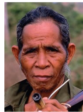
Population: 29,000 World Popl: 41,500 Total Countries: 3