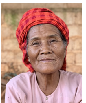
Main Language: Burmese Main Religion: Buddhism