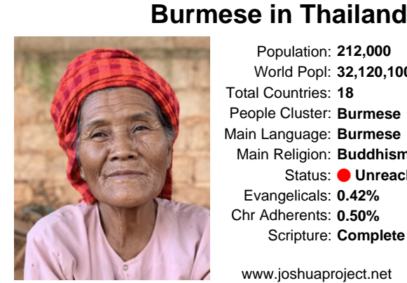
Population: 212,000 World Popl: 32,120,100 Total Countries: 18 People Cluster: Burmese Main Language: Burmese Main Religion: Buddhism

Status: Unreached Evangelicals: 0.42% Chr Adherents: 0.50%