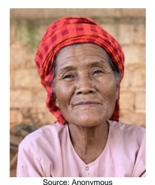
Population: 212,000 World Popl: 32,120,100 Total Countries: 18 People Cluster: Burmese Main Language: Burmese Main Religion: Buddhism Status: Unreached Evangelicals: 0.42%