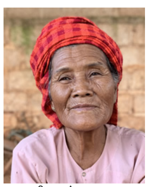
Population: 212,000 World Popl: 32,120,100 Total Countries: 18 People Cluster: Burmese Main Language: Burmese Main Religion: Buddhism

Status: Unreached Evangelicals: 0.42% Chr Adherents: 0.50%