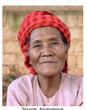
Population: 212,000 World Popl: 32,120,100 Total Countries: 18 People Cluster: Burmese Main Language: Burmese Main Religion: Buddhism Status: Unreached

Evangelicals: 0.42% Chr Adherents: 0.50%