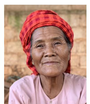
Population: 212,000 World Popl: 32,120,100