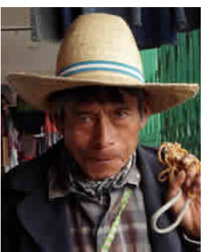
Population: 329,000 World Popl: 333,300 Total Countries: 2

People Cluster: Central American Indigeno