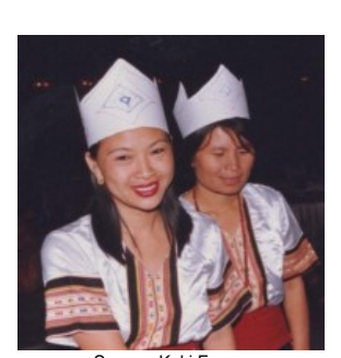
Population: 163,000 World Popl: 327,000 Total Countries: 3