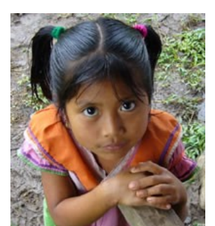
Population: 321,000 World Popl: 325,100