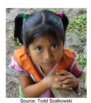
Population: 321,000 World Popl: 325,100 Total Countries: 2

People Cluster: South American Indigenous