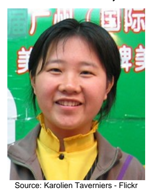
Population: 75,000 World Popl: 79,429,200 Total Countries: 36 People Cluster: Chinese Main Language: Chinese, Yue Main Religion: Buddhism Status: • Unreached Evangelicals: 1.30% Chr Adherents: 2.00% Scripture: Complete Bible