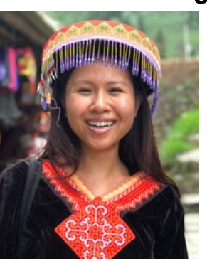
Population: 37,000 World Popl: 2,177,600