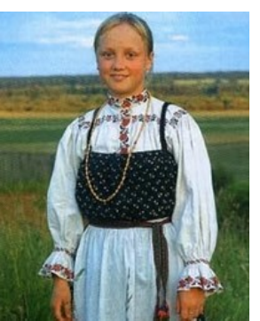
Population: 900 World Popl: 58,900 Total Countries: 4

People Cluster: Finno-Ugric Main Language: Komi-Permyak Main Religion: Christianity