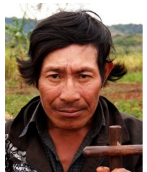
Population: 6,139,000 World Popl: 6,828,000

Total Countries: 4 People Cluster: Guarani