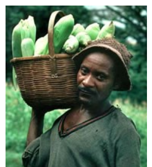
Population: 12,000 World Popl: 1,434,000

Total Countries: 7 People Cluster: Bantu, Shona