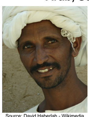
Population: 14,000 World Popl: 19,600,100

Total Countries: 19 People Cluster: Arab, Sudan