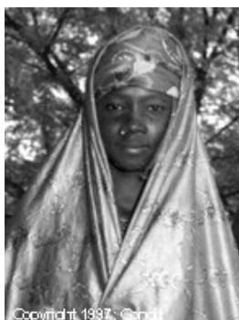
Copyright 1997: Bethany World Prayer Center

Population: 5,500 World Popl: 60,500 Total Countries: 3 People Cluster: Arab, Sudan Main Language: Juba Arabic Main Religion: Islam Status: Unreached Evangelicals: 0.00% Chr Adherents: 0.00% Scripture: Portions