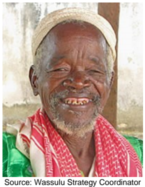
Population: 20,000 World Popl: 359,000 Total Countries: 3 People Cluster: Manding