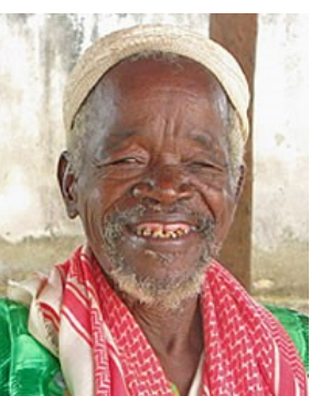
Population: 20,000 World Popl: 359,000 Total Countries: 3 People Cluster: Manding