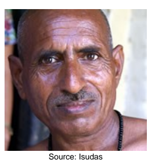
Population: 925,000 World Popl: 933,200 Total Countries: 3

People Cluster: South Asia Hindu - other