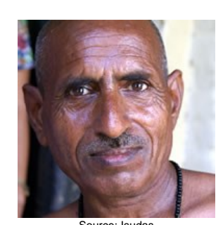
Total Countries: 3