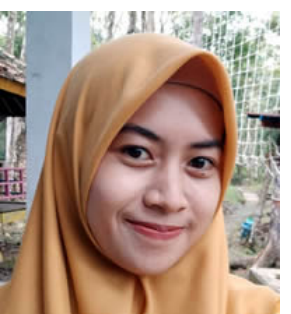
Javanese in Australia Population: 13,000

World Popl: 19,073,200 Total Countries: 9 People Cluster: Java Main Language: Javanese Main Religion: Islam