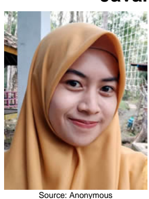
Population: 13,000 World Popl: 19,073,200

Total Countries: 9 People Cluster: Java Main Language: Javanese Main Religion: Islam