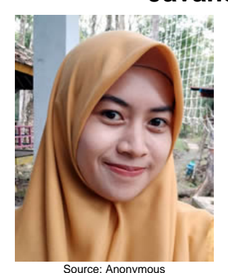
Population: 13,000 World Popl: 19,073,200 Total Countries: 9 People Cluster: Java Main Language: Javanese