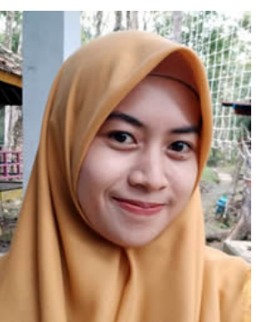
Population: 13,000 World Popl: 19,073,200 Total Countries: 9

People Cluster: Java Main Language: Javanese Main Religion: Islam