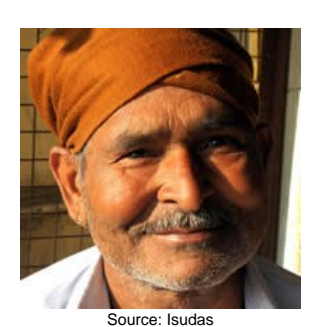
World Popl: 76,000 Total Countries: 1