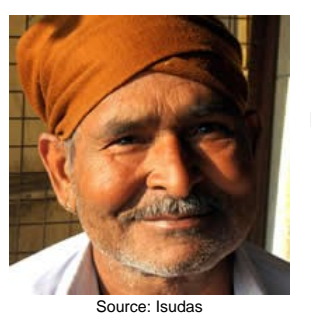
Population: 76,000 World Popl: 76,000 Total Countries: 1

People Cluster: South Asia Hindu - other