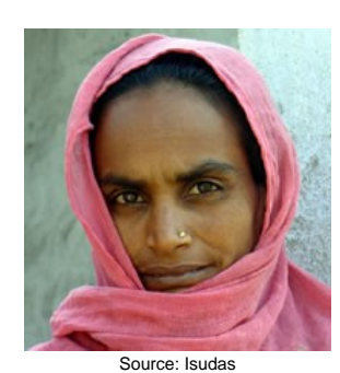
Population: 901,000 World Popl: 903,800 Total Countries: 2

People Cluster: South Asia Hindu - other