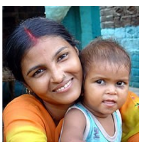
Total Countries: 3 People Cluster: South Asia Dalit - other