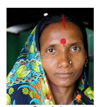
Population: 1,299,000 World Popl: 1,376,000