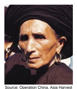
Population: 16,000 World Popl: 16,000 Total Countries: 1

People Cluster: Tibeto-Burman, other Main Language: Nasu, Wusa