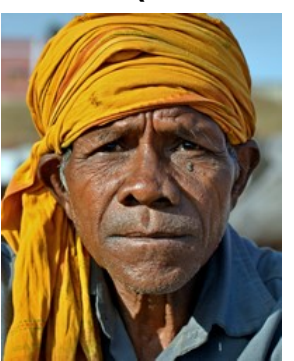
Population: 181,000 World Popl: 13,874,000