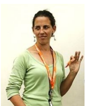
People Cluster: Deaf Main Language: Lithuanian Sign Language

Main Religion: Christianity Status: Superficially reached