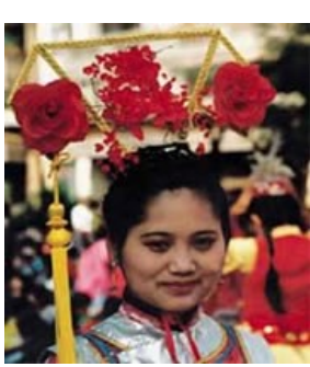
Population: 6,100 World Popl: 6,100 Total Countries: 1 People Cluster: Altaic

Main Language: Chinese, Mandarin Main Religion: Ethnic Religions