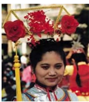
World Popl: 6,100 Total Countries: 1 People Cluster: Altaic Main Language: Chinese, Mandarin