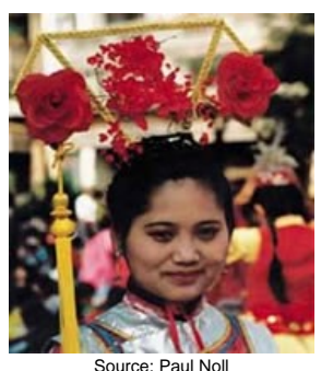
World Popl: 6,100 Total Countries: 1 People Cluster: Altaic

Main Language: Chinese, Mandarin Main Religion: Ethnic Religions Status: * Frontier Unreached