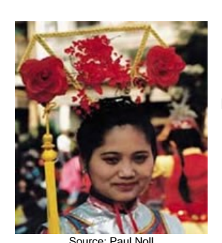
Population: 6,100 World Popl: 6,100 Total Countries: 1 People Cluster: Altaic

Main Language: Chinese, Mandarin Main Religion: Ethnic Religions Status: * Frontier Unreached