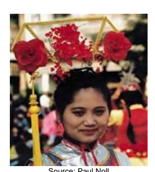
Population: 6,100 World Popl: 6,100 Total Countries: 1 People Cluster: Altaic

Main Language: Chinese, Mandarin Main Religion: Ethnic Religions Status: * Frontier Unreached