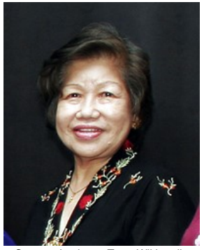
Population: 39,000 World Popl: 39,000 Total Countries: 1 People Cluster: Chinese

Main Language: Indonesian, Peranakan Main Religion: Ethnic Religions Status: Minimally Reached